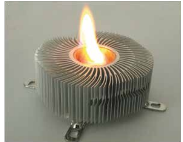
Figure 5: The Risk of Thermal Runaway

As electronic devices have increased in power, consumers have seen media coverage featuring devices catching fire and discussing theories of thermal runaway. Thermal runaway is chain of cyclical reactions of temperature rise that build upon