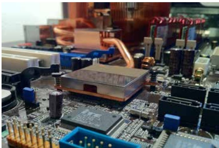
Figure 2: Personal Computer PCB and Heat Sink